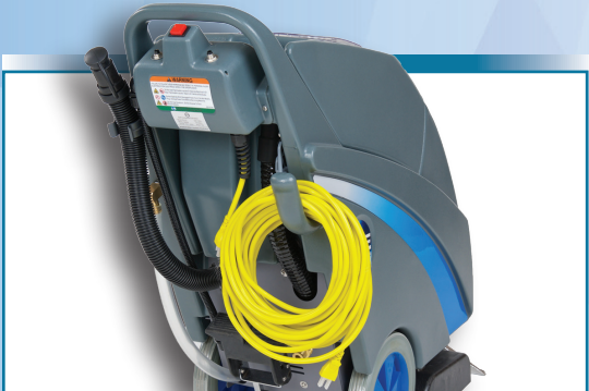
Ergonomic handle with simple finger-tip controls and built-in cord wrap for storage