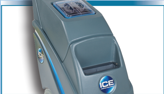
Clear recovery tank window and convenient fill area improve operator efficiency